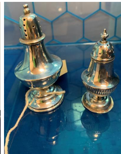
Some of the lots from the previous sale